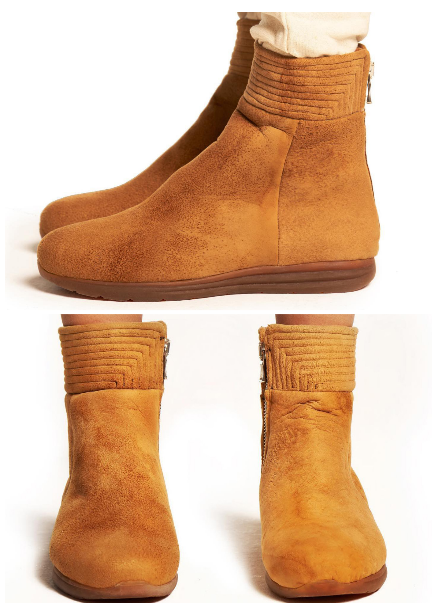
MuSkin ankle boots (Drew Veloric)

Products that some of our clients have manufactured with MuSkin: