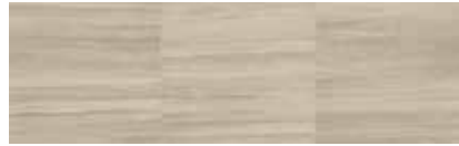
FEATURE BEIGE AR07