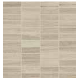
FEATURE BEIGE AR07