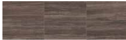
HEADLINE GREY AR10