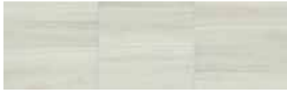
EDITORIAL WHITE AR06