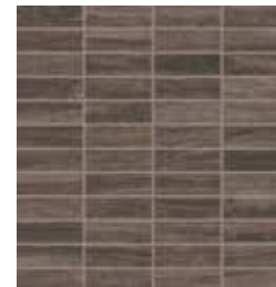
HEADLINE GREY AR10