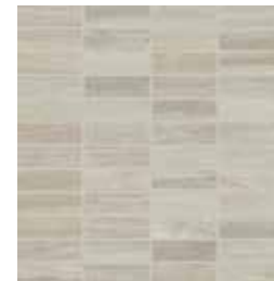
COLUMN GREY AR09