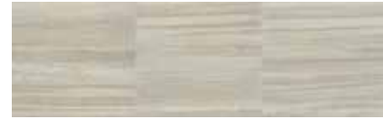
COLUMN GREY AR09