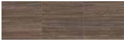
STORY BROWN AR08