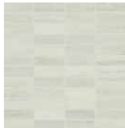
EDITORIAL WHITE AR06